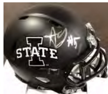
Allen Lazard Autographed Mini Helmet