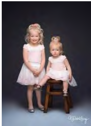
Studio Portrait Sitting