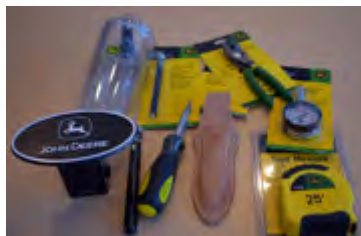
John Deere Tool Set