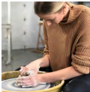
Ceramics Class for Two!