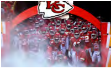
Kanas City Chiefs Tickets