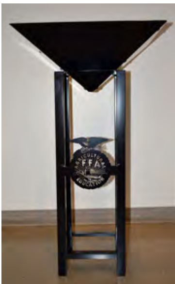
Steel FFA Planter