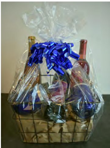
Two Saints Winery Basket