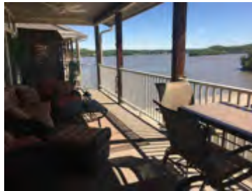
Ozark Vacation Condo