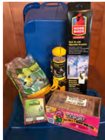
Bird Lovers Basket