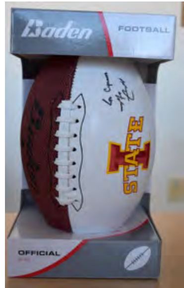
Matt Campbell Autographed Football