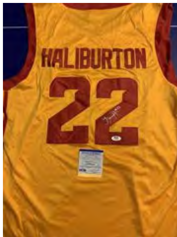
Tyrese Haliburton Autographed Jersey