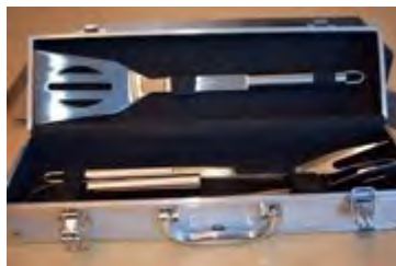
John Deere Grilling Set

No matter the size, your act of generosity will make a substantial impact to agricultural education in Iowa.